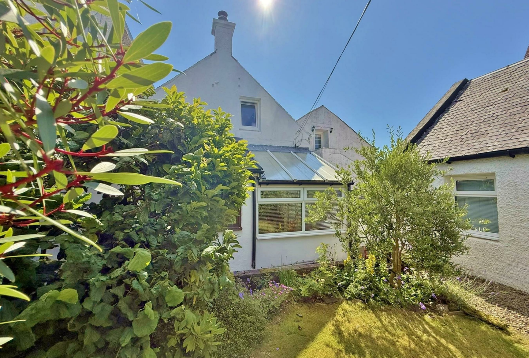
Tighaniar Cottage, Lamlash, Isle of Arran, KA27 8LS